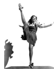
Ann Miller Born April 12, 1923 in Houston Texas

Ann Miller was an American actress and dancer. She is best remembered for her work in the classical Hollywood cinema musicals of the 1940s and 1950s.